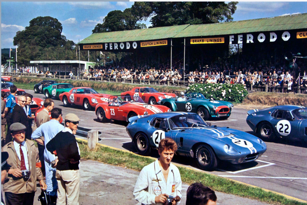
The starting grid at the Tourist Trophy race at Goodwood in August 1964. Phil Hill and Dan Gurney in Cobra Daytona Coupes and Jack Sears, Roy Salvadori and Bob Olthoff in Cobra Roadsters line up to take on 3 Ferrari GTOs of Innes Ireland, John Surtees and Tony Maggs and the Aston Martin of Mike Salmon. Gurney, Sears and Olthoff went on to finish 1-2-3 in the GT Class besting the GTO of Innes Ireland.